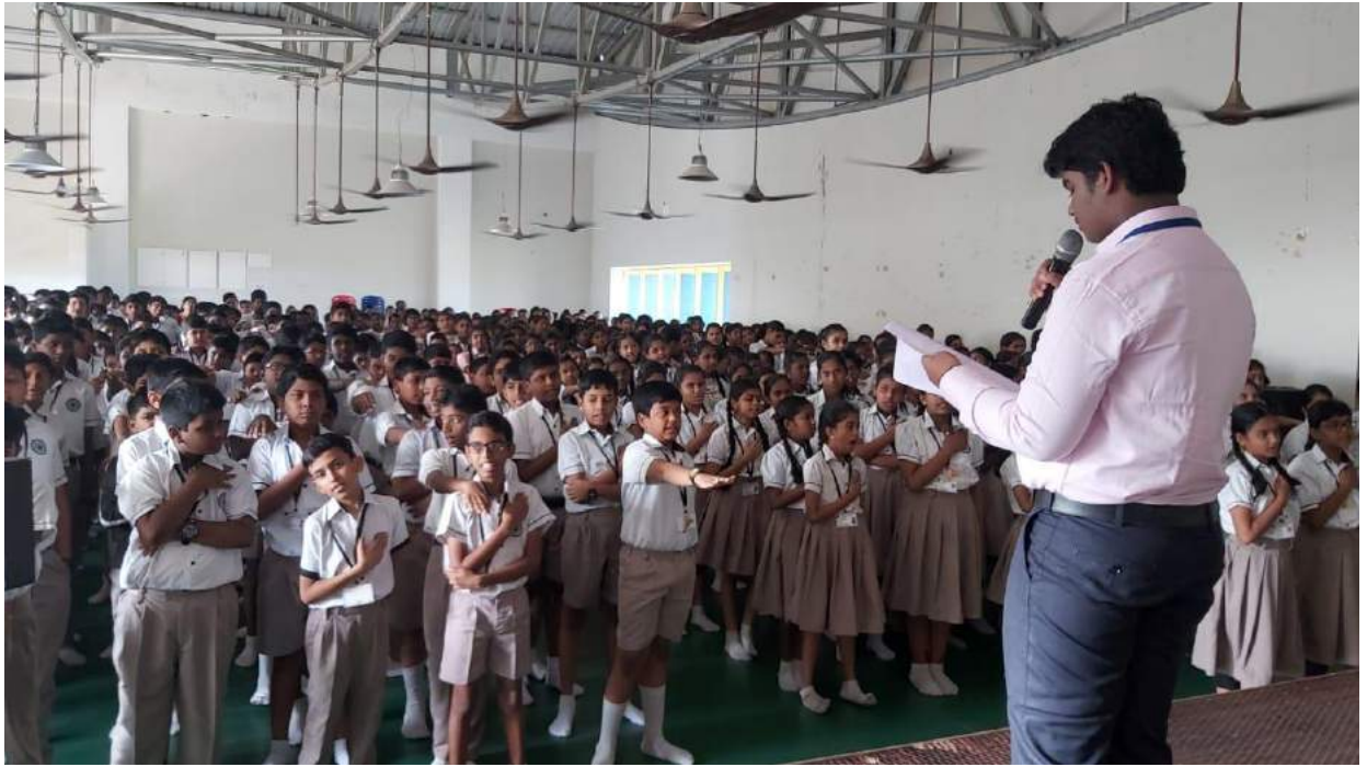
Students participating in Integrity Pledge taking ceremony