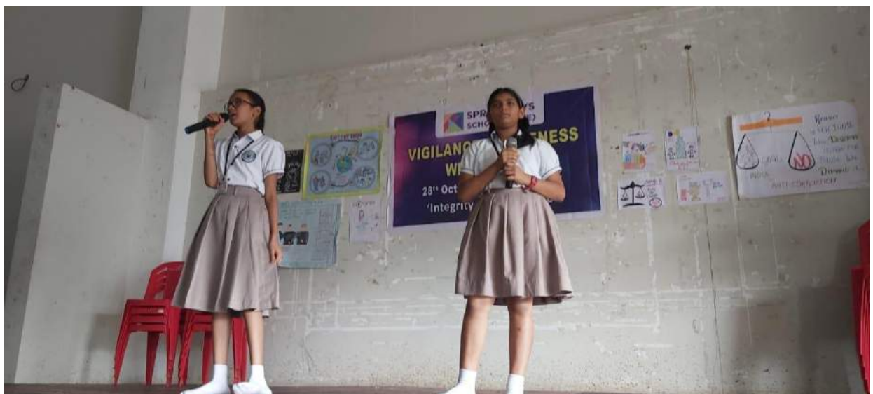
Class VIII girls having a conversation about the ill effects of corruption